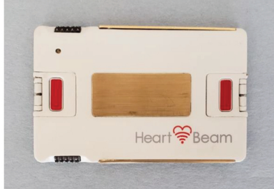
Telehealth device in inactive (planar) state

The foundation of our novel technology is the concept of vectorcardiography (VCG), a technology that has long been seen as superior to ECGs in detecting MIs, but is no longer used clinically because of the difficulty experienced by physicians interpreting the output. We solved the crucial problem of recording three orthogonal (x, y and z) projections of the heart vector with a device that is sized like a credit card. The thickness of our credit card sized ECG signal collection device is approximately 1/8 inch (3mm) and weighs approximately 1 ounce (28 grams).