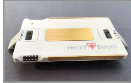
Telehealth device in ready to use state