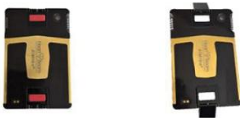
Photographs of version 1 HeartBeam AIMIGo devices in planer and ready to use position.

We believe our Products and services will benefit many stakeholders, including patients, healthcare providers, and healthcare payors. We are developing Generation 1 of our telehealth product (“HeartBeam AIMIGo™”) to address the rapidly growing field of RPM. HeartBeam AIMIGo is comprised of a credit card sized electrocardiogram device and a powerful cloud-based diagnostic expert software system. We believe that we are uniquely positioned to play a central role in remote monitoring of high-risk coronary artery disease patients, because the initial studies have shown that our ischemia detection system may be more accurate than existing RPM solutions.