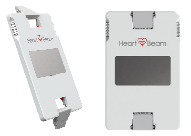
HeartBeam AIMIGo device in ready position (left) and the front view(right)

To date, we have developed working prototypes for HeartBeam AIMIGo and we have submitted the Product for FDA 510(k) clearance. To date, we have developed working prototypes for HeartBeam AIMIGo and we have submitted the Product for FDA 510(k) clearance. As more fully discussed in the Products and Technology section below, we have received questions from the FDA and are working through the stages of the FDA clearance process.